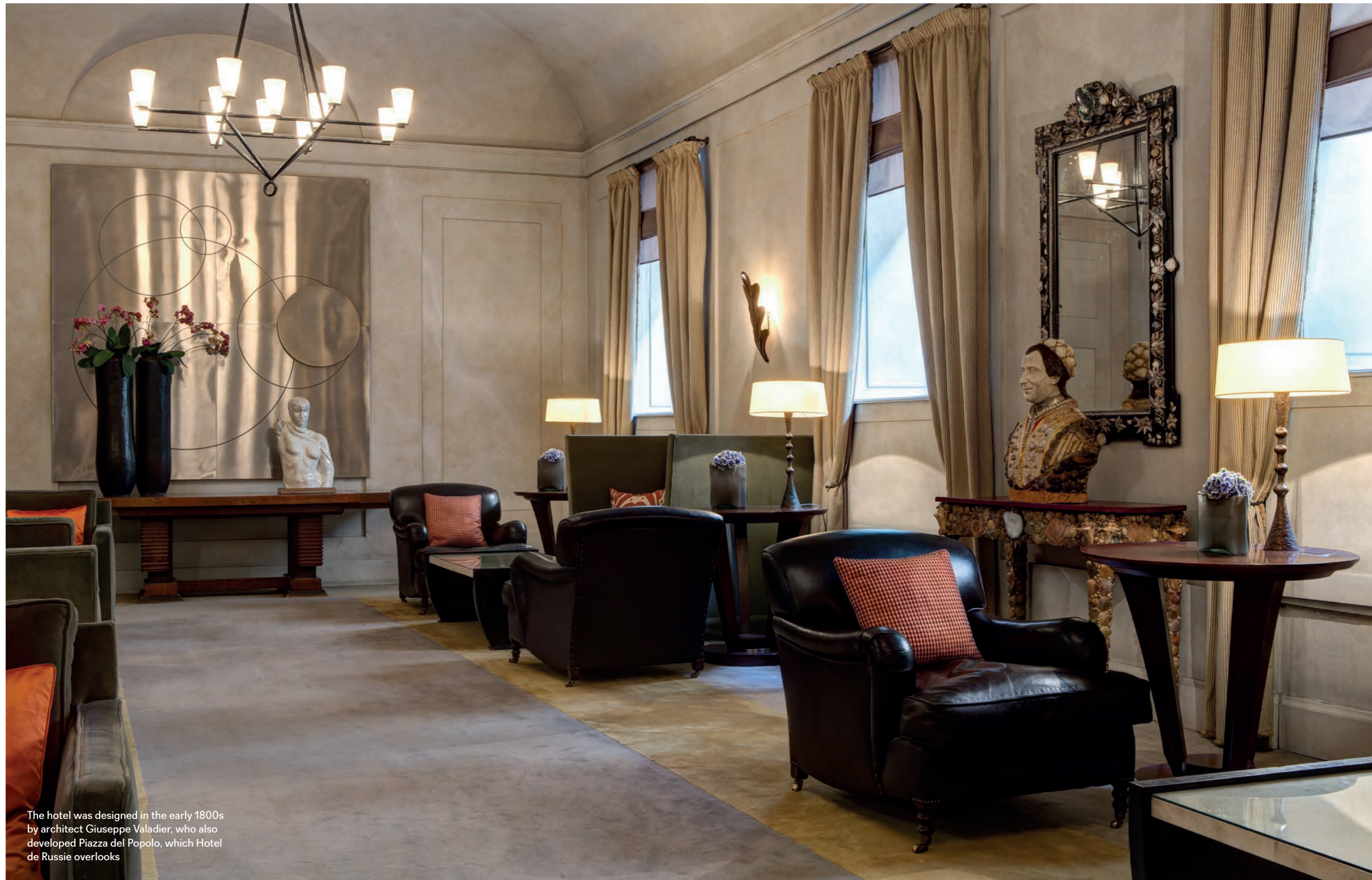
The hotel was designed in the early 1800s by architect Giuseppe Valadier, who also developed Piazza del Popolo, which Hotel de Russie overlooks