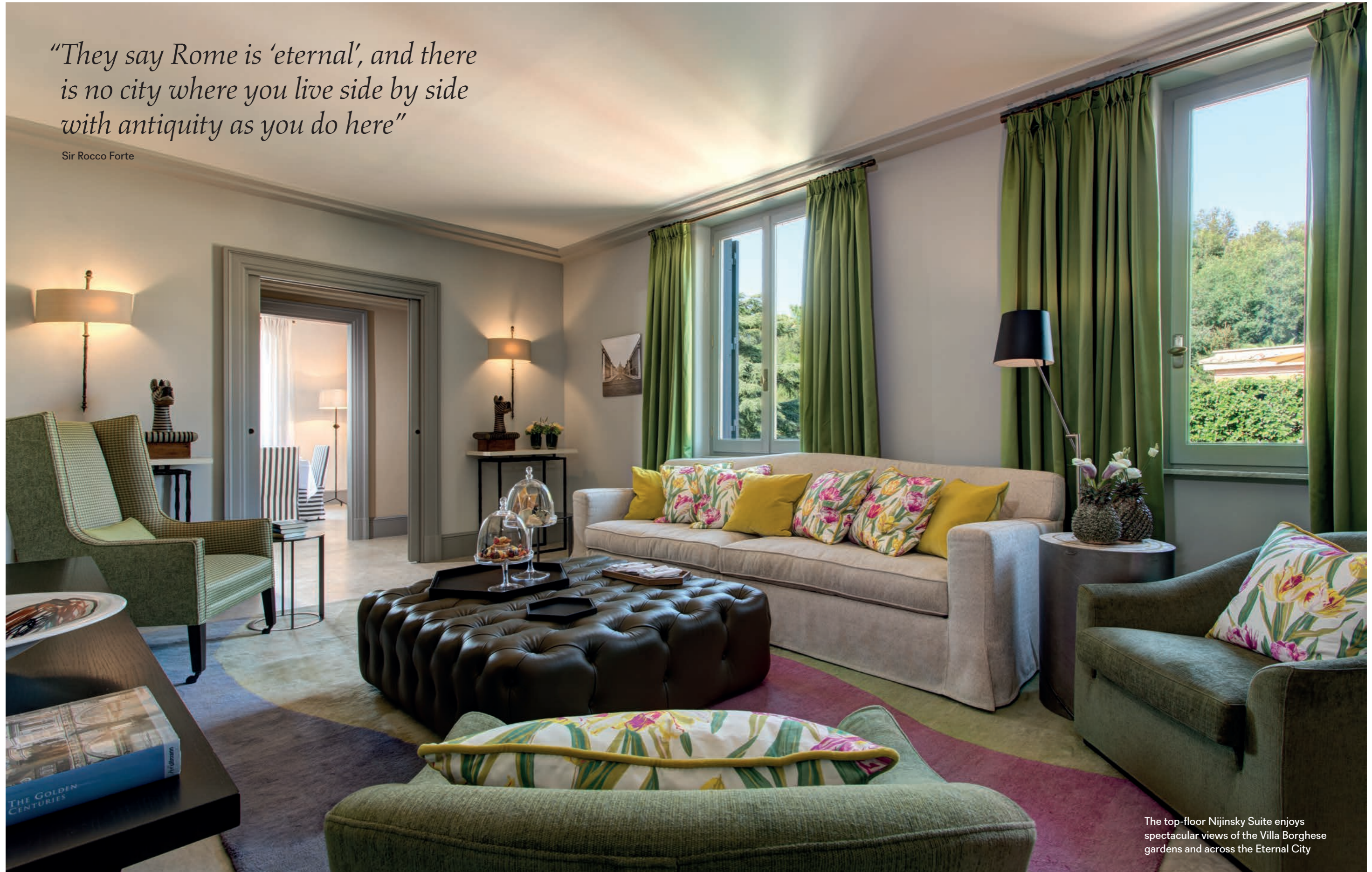
The top-floor Nijinsky Suite enjoys spectacular views of the Villa Borghese gardens and across the Eternal City